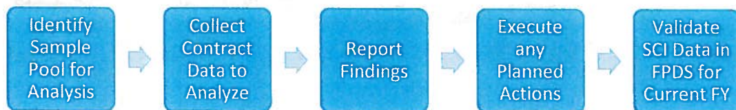
Figure 1: Analysis Process

To ensure the Department sufficiently addressed the service contract inventory requirements and developed a meaningful Analysis Report, a working group was formed consisting of representatives from each of DOC's five contracting offices. As a result of the collaborative effort of the working group, a repeatable process, as depicted in Figure 1, was established to comply with the annual service contract inventory requirements.